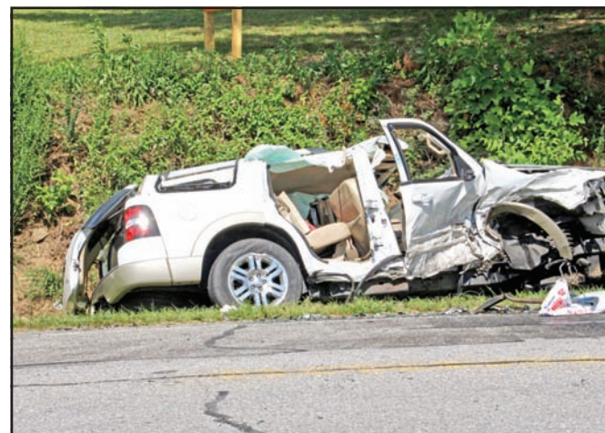
A bad accident occurred just in front of Rick's Rental on Saturday, Sept. 1, during a busy Labor Day weekend.